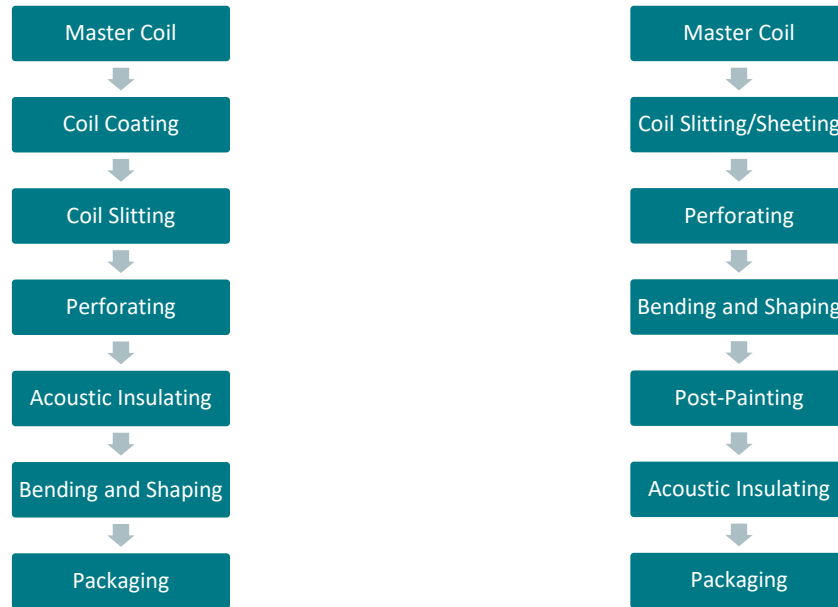
Figure 1: Typical steel specialty product manufacturing process, coil-coating (left) & post-painting (right)

According to ISO 14025, EN 15804 and ISO 21930:2017