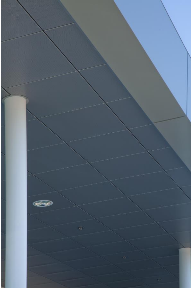
Steel specialty products include ceiling and wall systems, trims, and column, covers.

AN INDUSTRY-AVERAGE ENVIRONMENTAL PROFILE